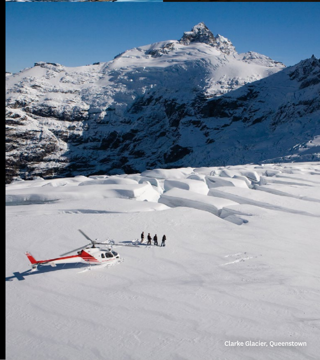
Clarke Glacier, Queenstown