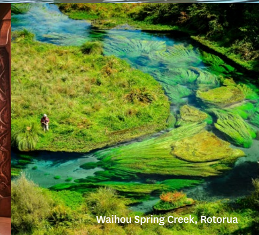
Waihou Spring Creek, Rotorua