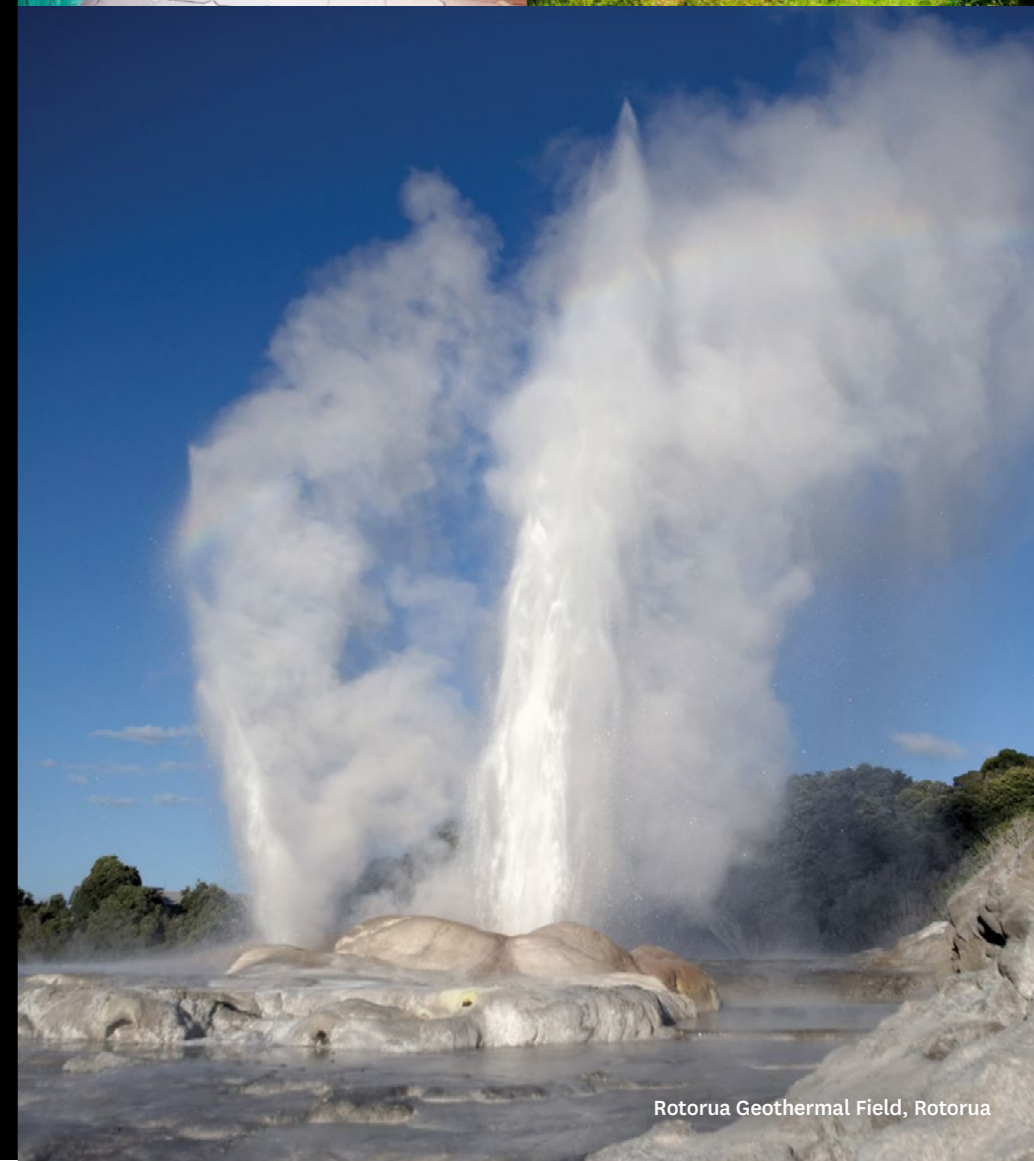
Rotorua Geothermal Field, Rotorua