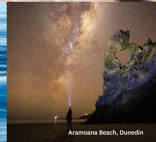
Aramoana Beach, Dunedin