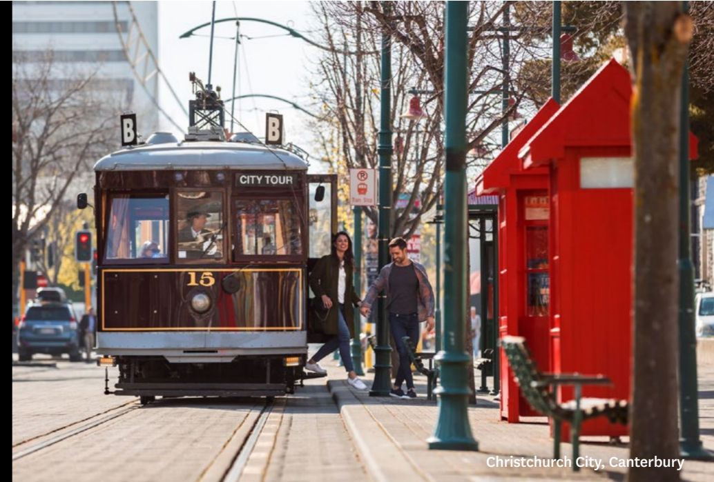
Christchurch City, Canterbury

Christchurch is a great gateway for any South Island adventure. Within easy range, choose from a coastal expedition north to Kaikoura's wildlife wonders, a breath-taking train journey across the Southern Alps or a lakeside sojourn in a dark sky reserve, perfect for stargazing. Let the adventure begin.